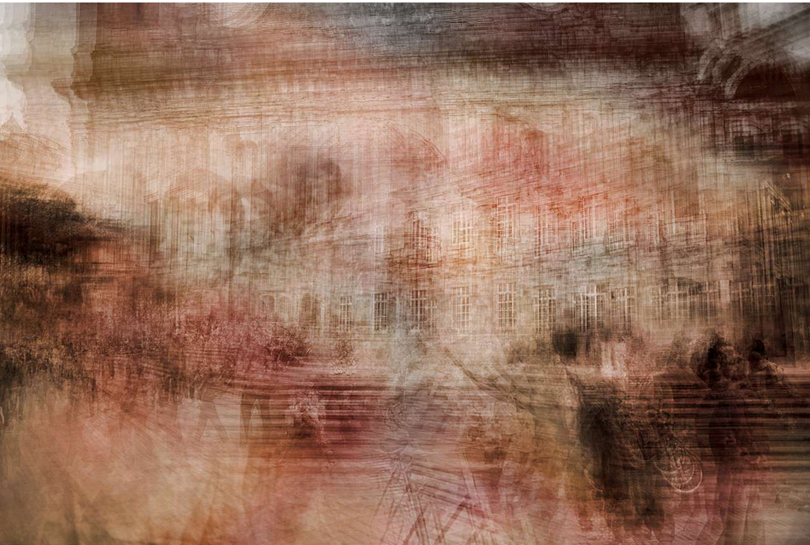
T h e C a t h e d r a l 4 3 . 3 X 6 2 . 9 i n